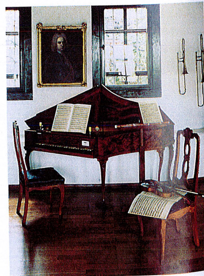
RIGHT: A room in Bach's probable birthplace, containing contemporary instruments.